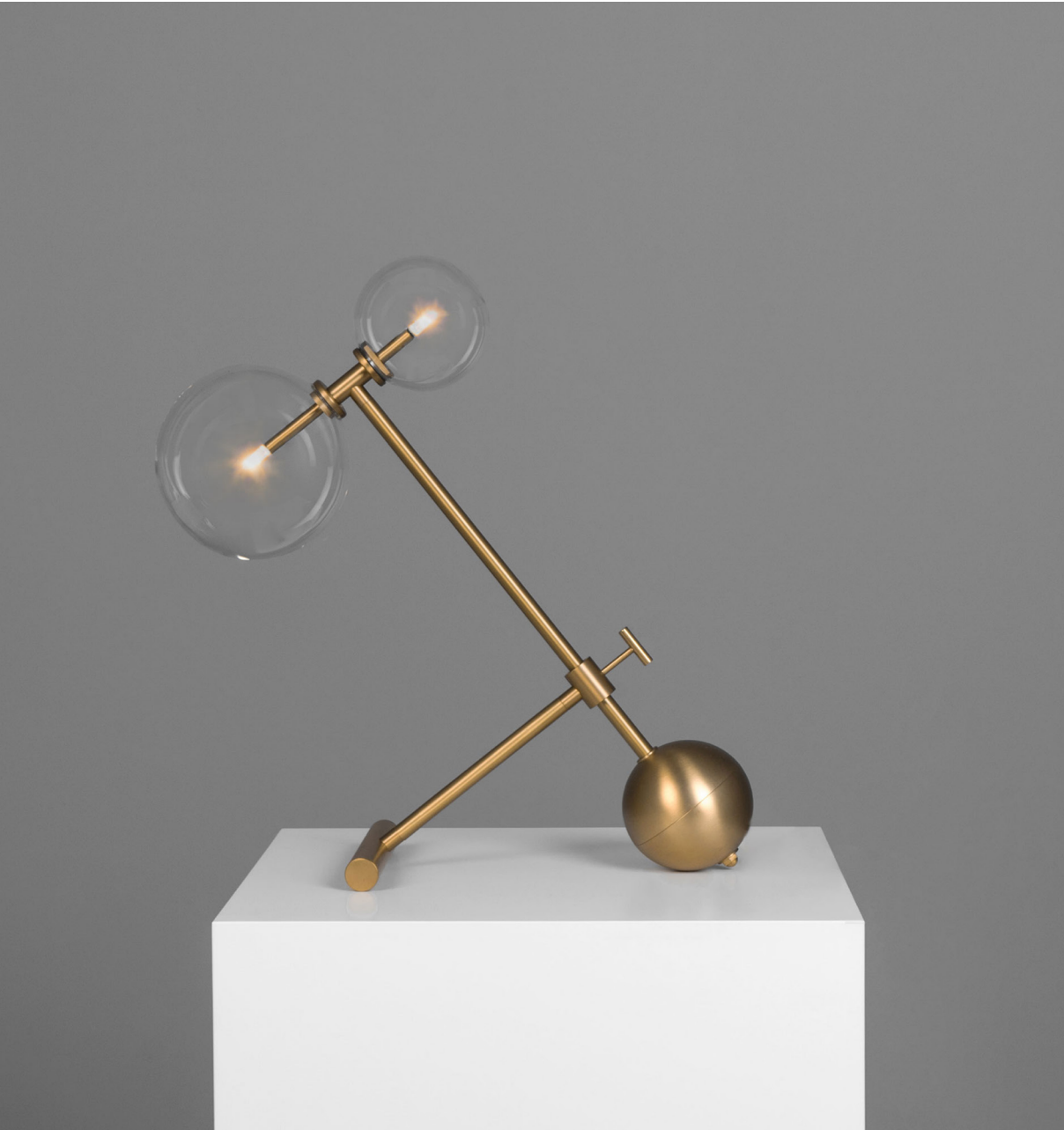
Zosia Table Lamp - B063